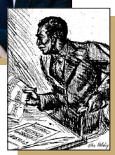
Newport Gardner, The Providence Journal 1936